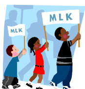
For Martin Luther King Day we watched